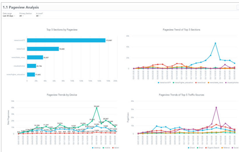
Data Insights pageview